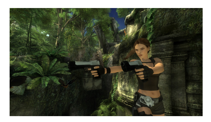
Fig. 1. A screenshot from Tomb Raider: Underworld level "Thailand".